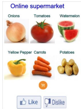
Figure 1. The product-list screen of the supermarket application, with Like and Dislike buttons

To illustrate these principles, consider a small online supermarket application, whose main screen is shown in Figure 1.